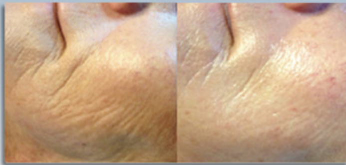
Fine Lines & Wrinkles